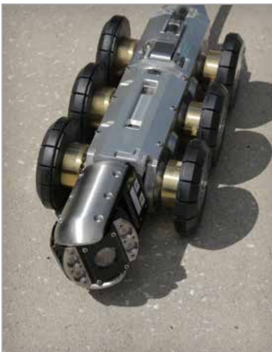
**The photo above includes an OZIII Camera.

10X optical zoom and 12X digital zoom; total 120:1 zoom capability.