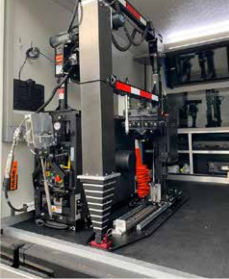
Boom Arm-Out Position