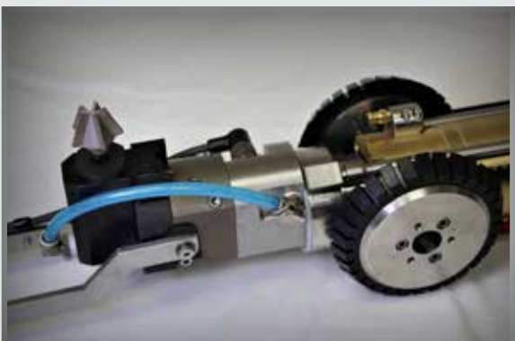
> WATER BLOW-OFF & WIPER