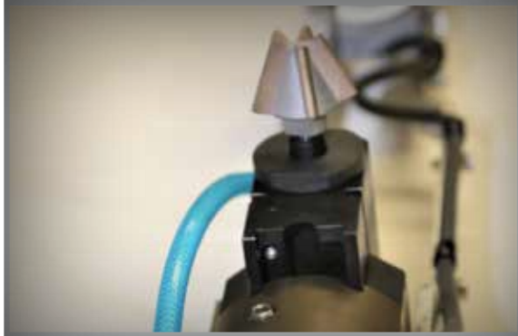
> VARIETY OF BITS AVAILABLE