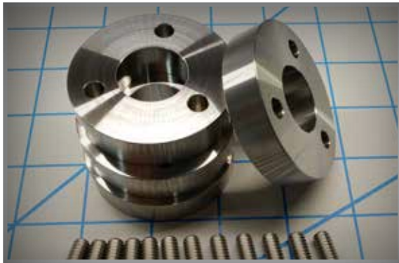
> OPTIONAL PARTS AVAILABLE