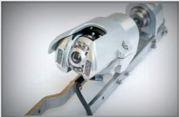
> CURRAHEE CUTTER CAMERA