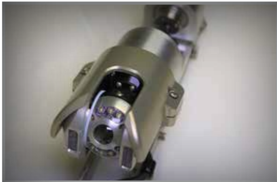
> CURRAHEE CUTTER CAMERA