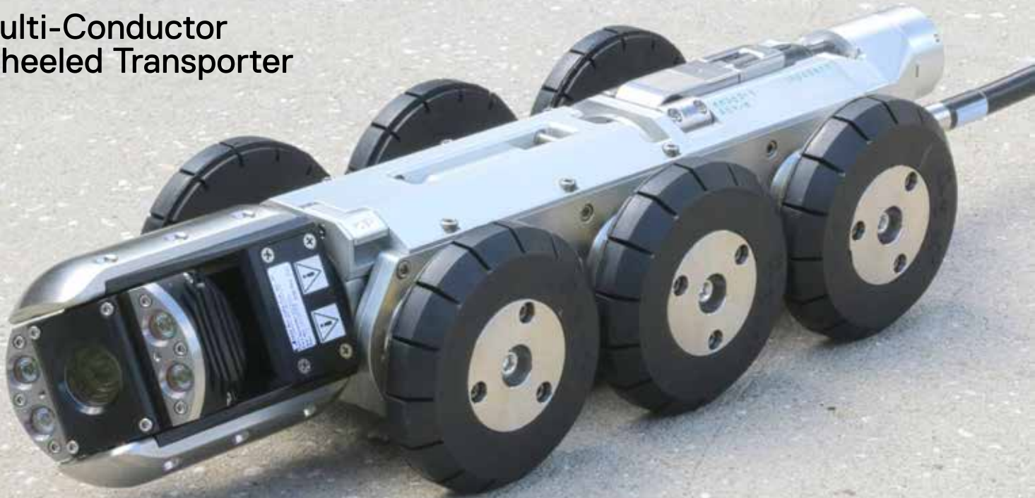
CPR transporter shown with the optional OZIII camera.