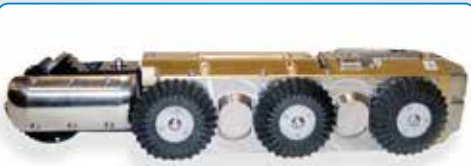
CPR in the 6" (152 mm) Rubber Configuration

The Compact Pipe Ranger (CPR) is designed to operate on a minimum of 1000' (305 m) of multi-conductor TV cable to inspect 6" (152 mm) relined through 48" (1219 mm) diameter pipe. The Compact Pipe Ranger (CPR) includes full-proportional steering to traverse meandering pipe and 45 and 90 degree turns. The superior pulling power of the CPR, combined with the optics and directional lighting of the compact OZIII zoom pan and tilt camera (with the ability to rotate in a 4" (102 mm) circle), creates video inspection quality that's unsurpassed in the industry.