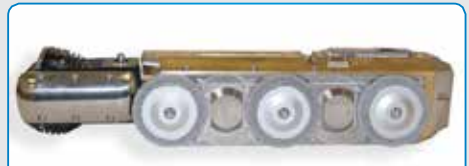
CPR in the 6" (152 mm) Steel Configuration