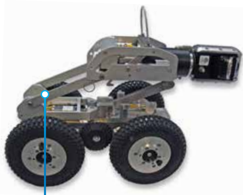
Optional Power Camera Lift