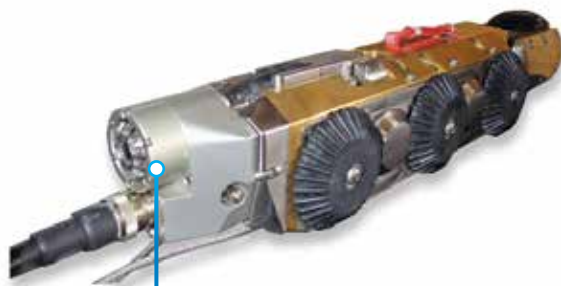
Optional Rear-Viewing Camera

An optional rear-viewing camera, which is mounted to the CPR transporter, is available to help avoid obstacles and potential tip-overs in the pipeline by providing visibility when retrieving the transporter or driving in reverse.